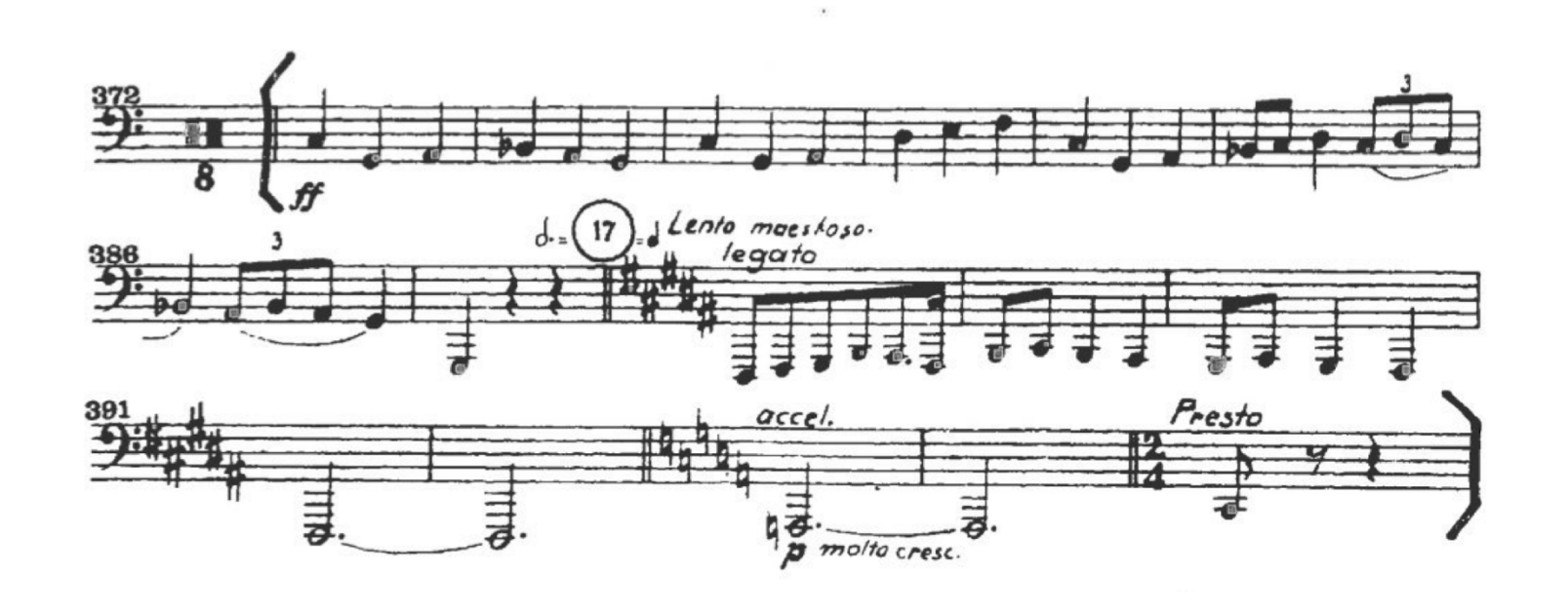
Greishwin-An American in Paris